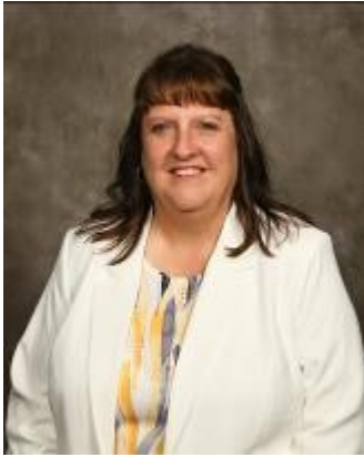
Patty Bricker First Lady 2025