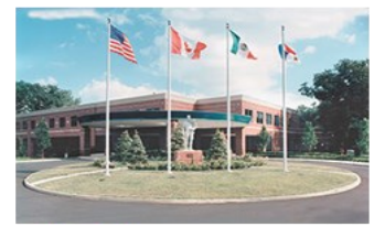
ERIE, PA* Orthopaedics 814-875-8700