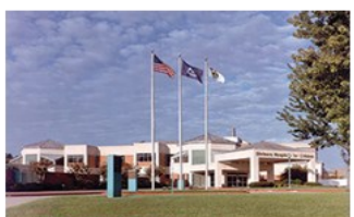
SHREVEPORT, LA Orthopaedics Cleft Lip and Palate 318-222-5704