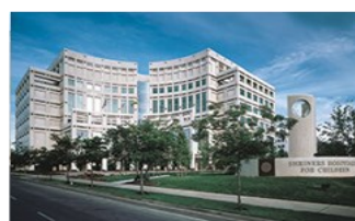
SACRAMENTO, CA Burn Care Cleft Lip and Palate Orthopaedics Pediatric Surgery Spinal Cord Injury 916-453-2000