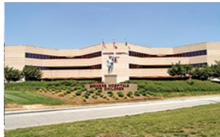
GREENVILLE, SC Orthopaedics 864-271-3444