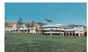
SALT LAKE CITY, UT Orthopaedics 801-536-3500