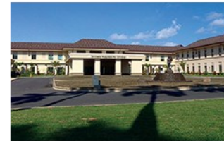
HONOLULU, HI Orthopaedics 808-941-4466