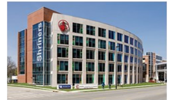
LEXINGTON, KY* Orthopaedics 859-266-2101