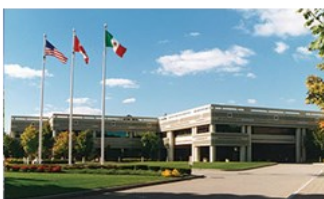
SPRINGFIELD, MA Cleft Lip and Palate Orthopaedics Rheumatology Urology 413-787-2000