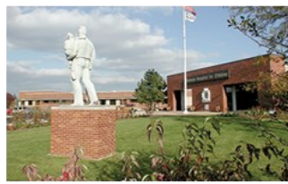
CHICAGO, IL Orthopaedics Spinal Cord Injury Cleft Lip and Palate 773-622-5400