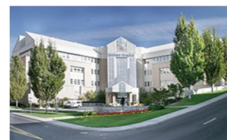
SPOKANE, WA Orthopaedics 509-455-7844