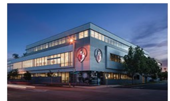
PASADENA, CA* Orthopaedics Burn Care Cleft Lip and Palate 626-389-9300