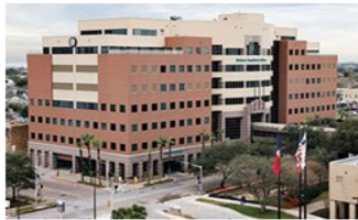
GALVESTON, TX Orthopaedics Cleft Lip and Palate Burn Care 409-770-6600